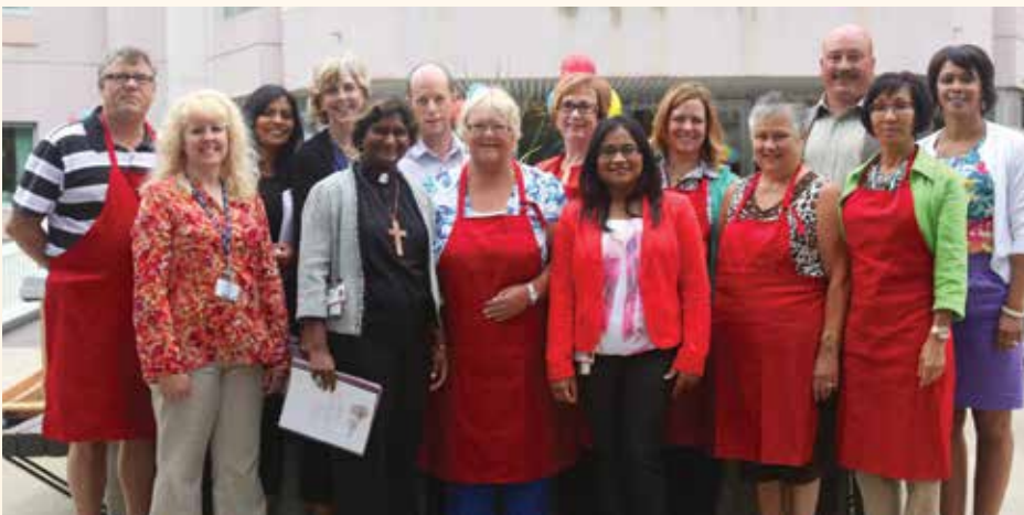
The leadership team at Southgate Care Centre.