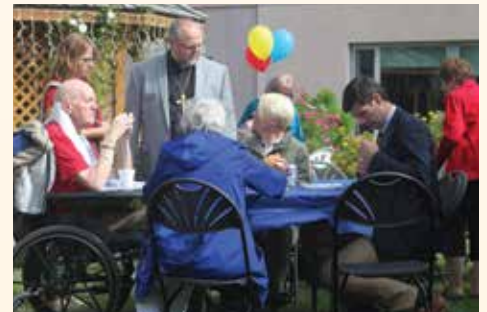
Guests enjoying the BBQ.