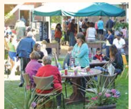
Guests enjoying the festivities.