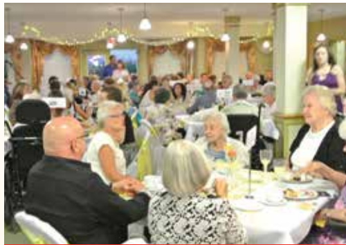
Guests at Good Samaritan Heron Grove enjoying desserts and fellowship.