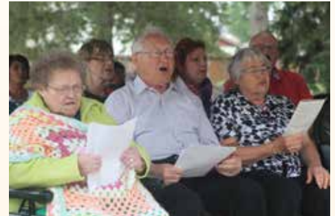
Guests singing a hymn during the service.

Following the official ceremony, all guests were treated to a delicious BBQ, with all the fixings, catered by the staff at Good Samaritan Southgate Care Centre.