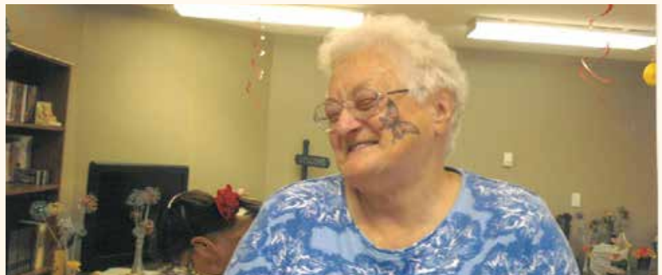
Face painting was enjoyed by everyone at Good Samaritan Pembina Village, Evansburg! See Page 8 for full story.

A total of six events were held across GSS and each one was a tremendous success with over $40,000 raised and more than 800 people attending across two sites in British Columbia and four in Alberta. Congratulations to everyone for a job well done!