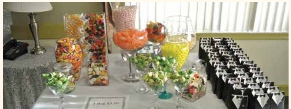
A sweet tooth's dream candy bar!

Canadian Restaurant Supply Care Systems Services Ltd. Creekside Animal Clinic Drain Right Plumbing Services Firesafe Sprinkler Systems Good Earth Landscaping Services Interior Appliance Service Medical Pharmacies North Valley Contracting Ltd.