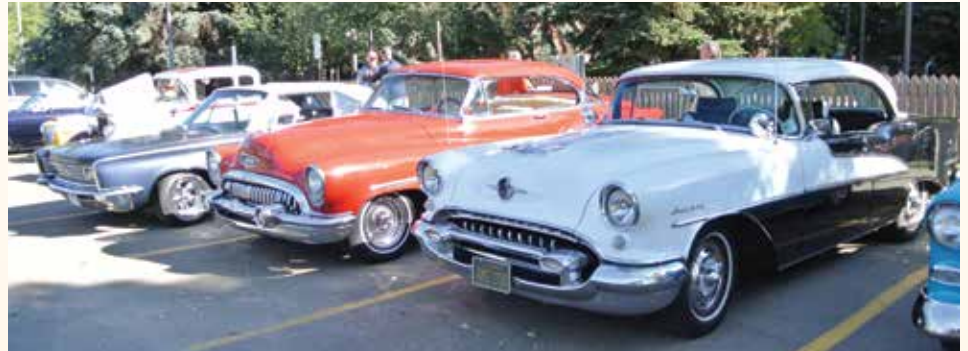
Antique car show.

Capital Power – Retiree Phil Bisailon Imperial Oil – Retiree Fred Elger Employees of Weir Oil and Gas Ottewell IGA