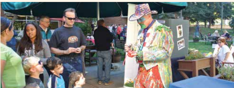
Children waiting for the clown.