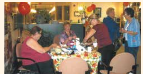
Residents and staff getting ready for the big day.

Dave Reid Trucking Hayduk Picker Service Ltd. Pembina Contracting Ltd. Reno Contracting Ltd.