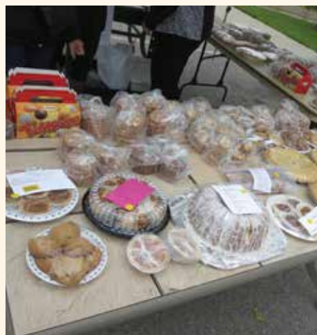
Bountiful baking table.