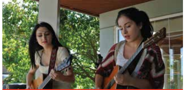
Star entertainment by The Command Sisters.

Country music, hay bales, dancing and a "dress country" contest were just a few features of the sunny and lively activities at Good Samaritan Spruce Grove Centre on a very sunny September day.